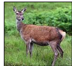
Red Deer - Hind