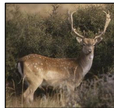
Fallow Deer - Buck