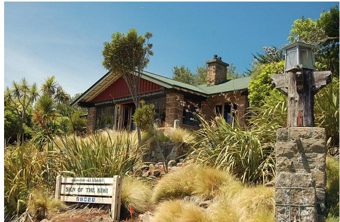
Sign of the Kiwi.

The Sign of the Kiwi and the Sign of the Takahe stand as two remarkable rest houses that survived the 2010-2011 earthquakes but required extensive restorations to preserve their integrity and charm. Each of these structures not only represents a vital piece of history but also serves as a welcoming point for those exploring the picturesque vistas along the Summit Road.