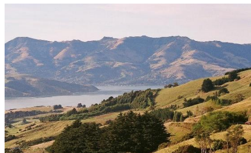
Lyttelton harbour from Packhorse hut track